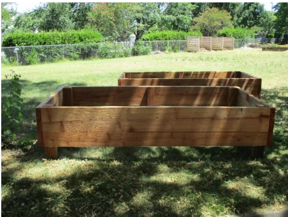
Our newest raised-bed garden boxes.